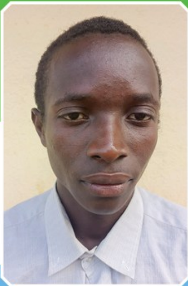
Adikalie Kamara Village of Small Kamakwie