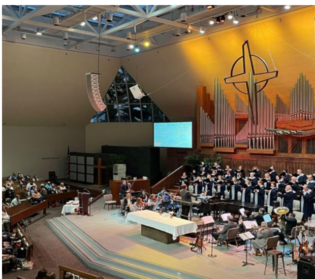
ECO National Gathering 2023.

PS. This week you have options.... share a table and/or reach out and bless three people. Remember, we are seeking to develop a "habit." Email back with stories, I'd love to hear your experiences from this week and last!