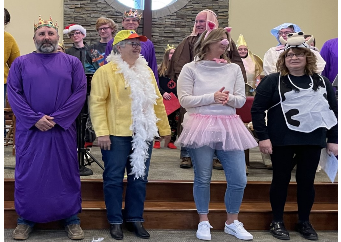
It may be January, but we still celebrate the arrival of good news!